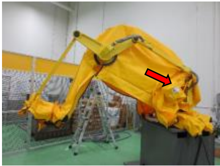
(Main) Arms Covered. Note: Boomerang, Ring (J3) and J2 Pocket (arrow)