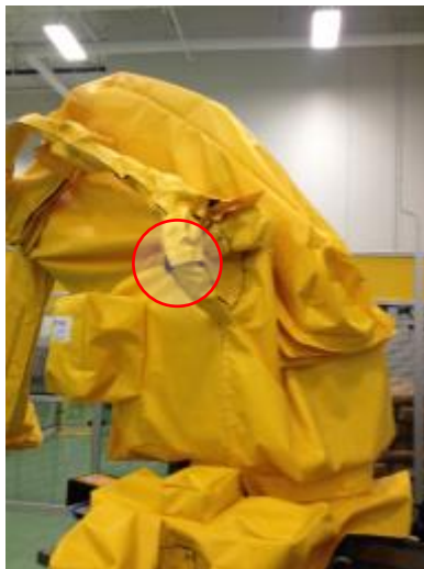
J2 Detail Note Cable Cuff to Aft Link Arm.