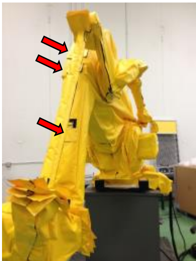
Link Arms and Boomerang Fitted Note: Velcro Access Panels