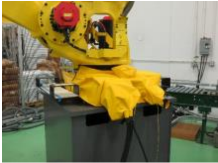
Installation of Stationary Base Cover Note: Pedestal Cover not shown