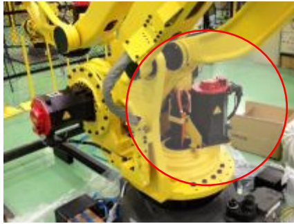
Cover J1 Motor BEFORE Proceeding