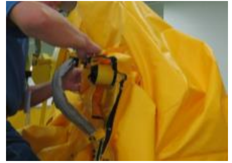
Install Lower and Upper Arm Cover