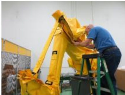
Starting Near J4, Install the Fwd Link/Boomerang. Move Toward J2